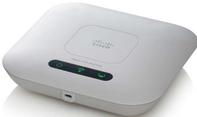
Figure 1. Front Panel of the Cisco WAP321 Wireless-N Selectable Access Point with PoE