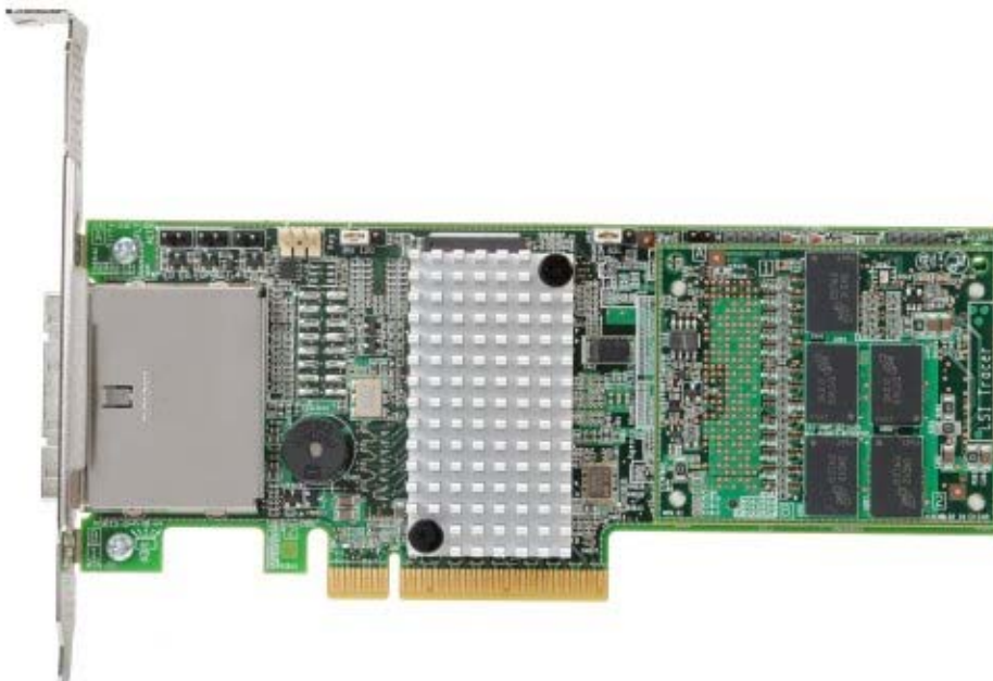
Figure 1. ServeRAID M5120 SAS/SATA Controller (with flash module)

Figure 1 shows the ServeRAID M5120 controller.