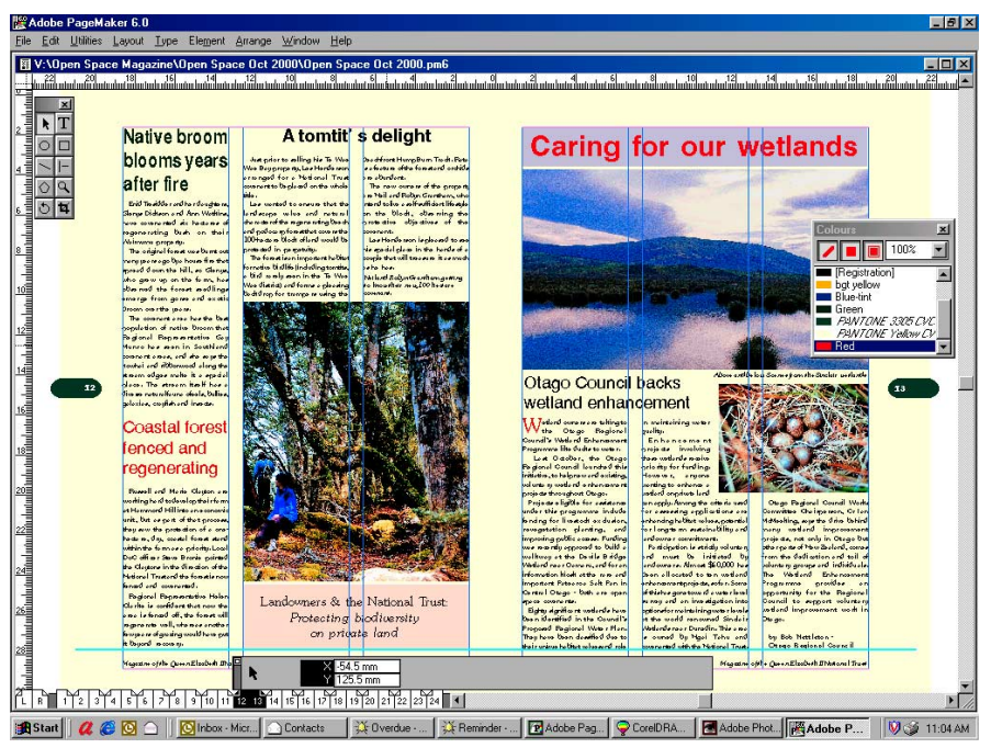
TBD relies on Adobe PageMaker for a range of publishing projects—from simple pages to full magazines. Features such as masking of images into frames, global removal of colors, and excellent PostScript functionality support the firm's ability to meet its clients' needs and high expectations.

colors, and excellent PostScript* functionality combine to make PageMaker invaluable in allowing us to produce work that satisfies our clients' high expectations. Equally important is speed—PageMaker is fast as a rocket on our PCs."